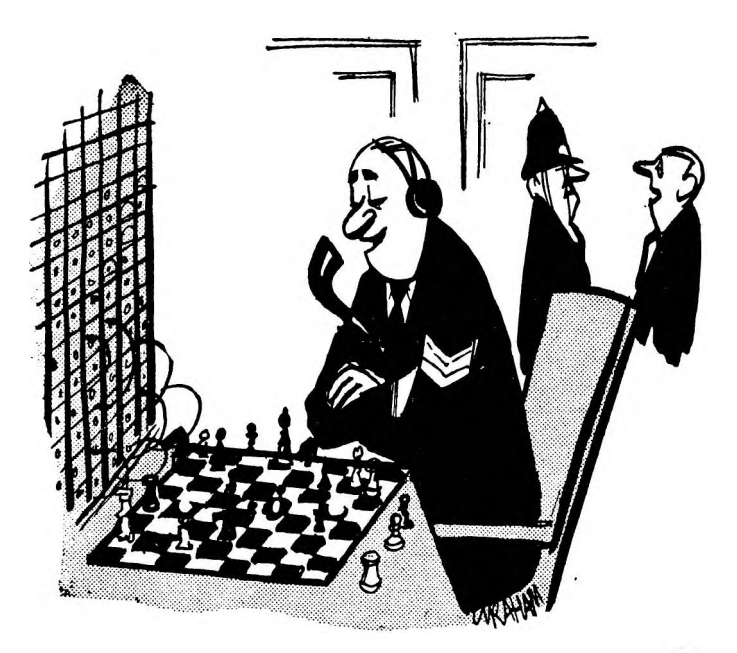
"Calling Car 69 . . . Queen's Rook takes Bishop . . . Over . . ."